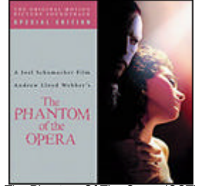
The Phantom Of The Opera (OST)