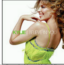
I Believe In You - Kylie Minogue