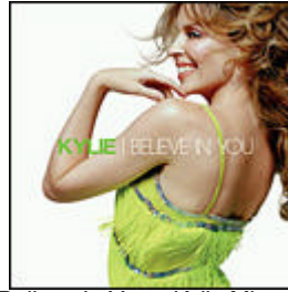
I Believe In You - Kylie Minogue